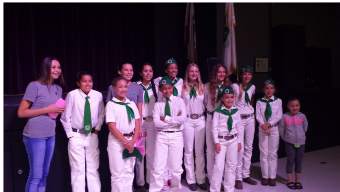
Sierra Shadows Members 4-H Achievement Night posing with pride.