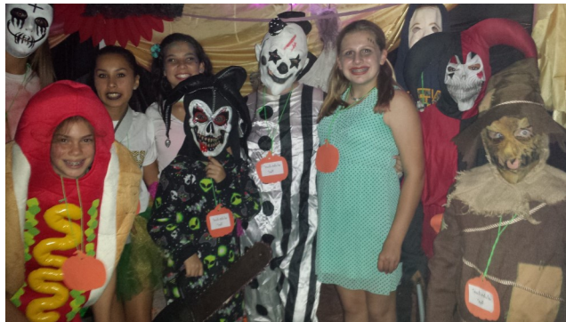
Community Pride Haunted Forest Staff ready to start

Keep an eye out for some upcoming events we will be doing like the Ranchos Tree Lighting with the Chamber of Commerce.