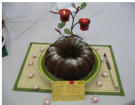
My banana bread that I made for Favorite Foods Day, January 2009