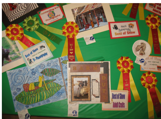
Best of Show art, Chowchilla Fair, May 2009 (grasshopper by me)